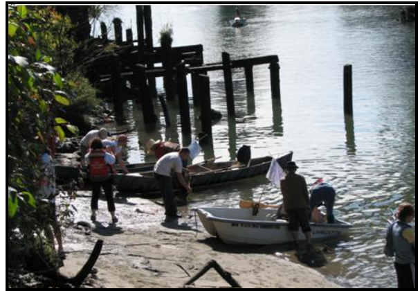
...at the Snohomish River

Our Creation Stewards hosted a 350.org event on Saturday, September 24 th , focusing on reducing our dependency on fossil fuel and helping to end hunger in our community.