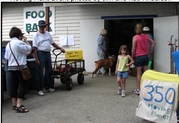
Just about finished with the produce delivery!