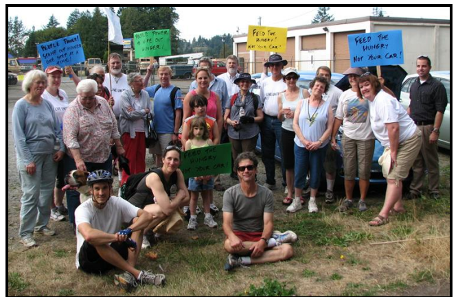
Crew of Volunteers from St. John's and the Community