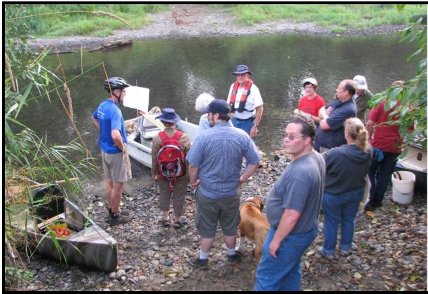
Loading the produce...