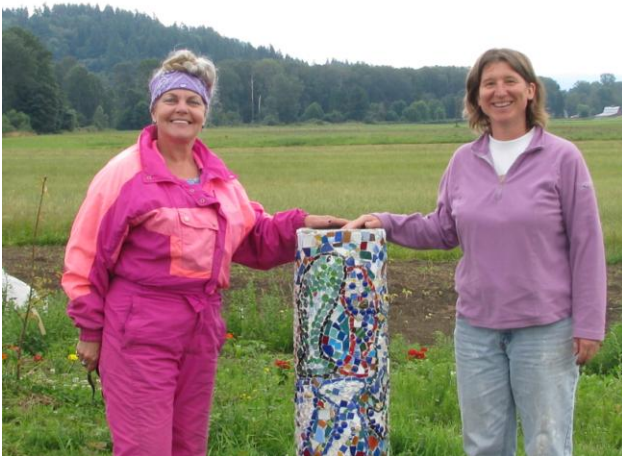
Mosaic Fish Column in the St. John's Garden at Chinook Farms