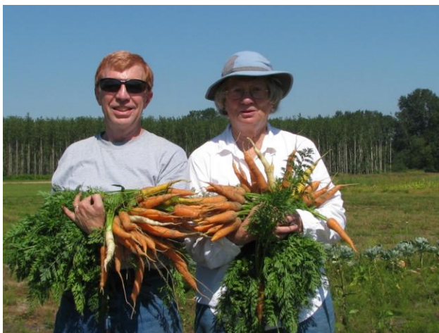
Carrot Harvest in the Church Garden