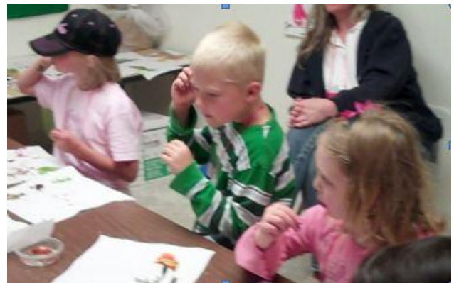
Listening to Seeds

The first week of August brought a hustle and bustle to the Parish Hall and Sunday School classrooms as 18 energetic young people gathered for Vacation Bible School to learn about the Abundant Life Garden. There were different themes each day - water, seeds, soil, animals and harvest. Every day included projects, prayers, songs and Bible stories, and the kids learned a special song "Together We Can Change the World".